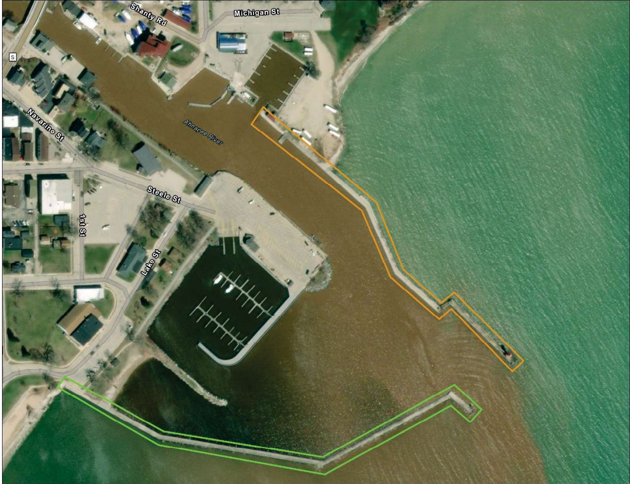
Figure 1: Project Map

Note: green lines indicate the extent of the South Breakwater and orange lines indicate the extent of the North Pier.